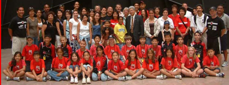
Left: 96 Boys & Girls with Senator Akaka Below: 96B with Shane Isono (00B)